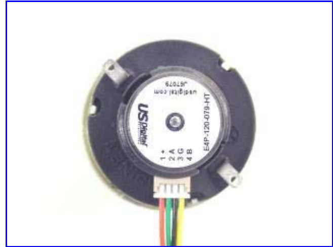
Image of encoder on motor.